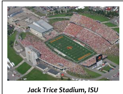
Jack Trice Stadium, ISU

During this three-day workshop, participants will experience off-site tours including visits to Iowa State's Jack Trice Stadium, Jacobson Athletic Building, Ames' Dog Park, the beautiful $6,800,000 Ada Hayden Heritage Park, one of our most popular facilities - Carroll Marty Disc Golf Course and the up and coming Furman Aquatic Center. Another highlight will include visiting an environmentally-sensitive recreational area, Calhoun Park.