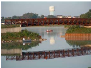
Ada Hayden Heritage Park, Ames

Along with our excitement about the many things planned, we are also gearing up for a BBQ at beautiful Score Park in Nevada. The evening will also include a night of fun at Perfect Games followed by an early Thursday morning Fun Run to promote healthy, active living.