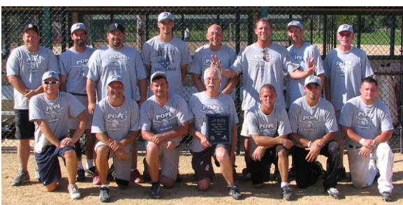
Pope Insurance of Boone, winners of the IPRA/Iowa ASA Men's 14 Inch Major State Tournament.

A total of forty softball teams took the field at Tait Cummins Softball Complex in Cedar Rapids August 21, 22 and 23 to participate in the annual IPRA/Iowa ASA 14 Inch Slow Pitch State Tournament. Three classifications of play were offered, and winning teams are shown below. Team trophies were awarded to the top four teams in each classification.