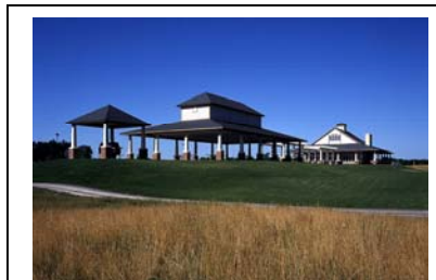
Coldwater Golf Links, Ames