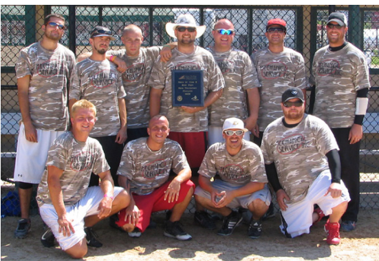
Receiving the honor of first place finish for the IPRA/Iowa ASA Men's 14 Inch Class B Tournament was the team Mechanical Service, Inc. of Cedar Rapids.