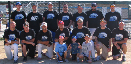
Winners of the IPRA/Iowa ASA Men's 14 Inch Class A State Tournament—Emil's Deli of Cedar Rapids.