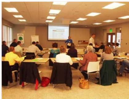
Participants at a previous Young/New Professionals Forum