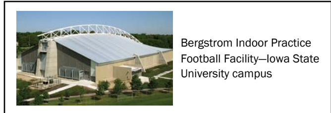
Bergstrom Indoor Practice Football Facility—Iowa State University campus

Results of each age division can be viewed at www.iapra.org .