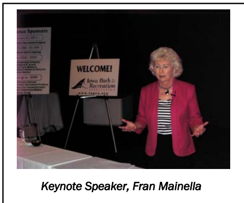
Keynote Speaker, Fran Mainella