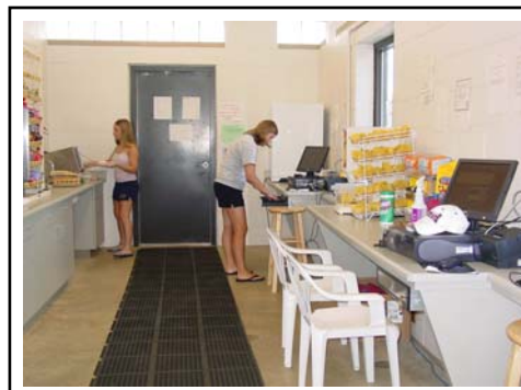
Concession workers gain first-hand knowledge of “customer service”.