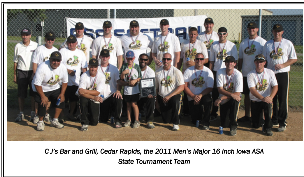
C J's Bar and Grill, Cedar Rapids, the 2011 Men's Major 16 Inch Iowa ASA State Tournament Team