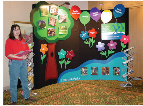
EXHIBIT HALL SCHEDULE