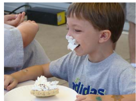
Out of this world pie