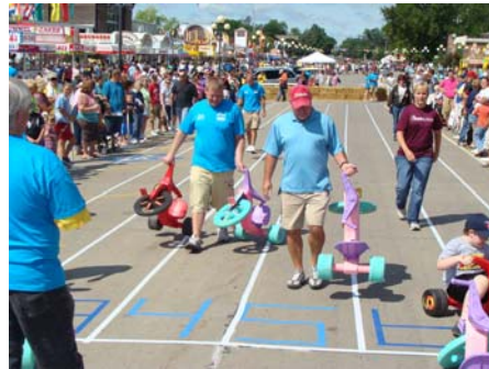
Big Wheel Wranglers