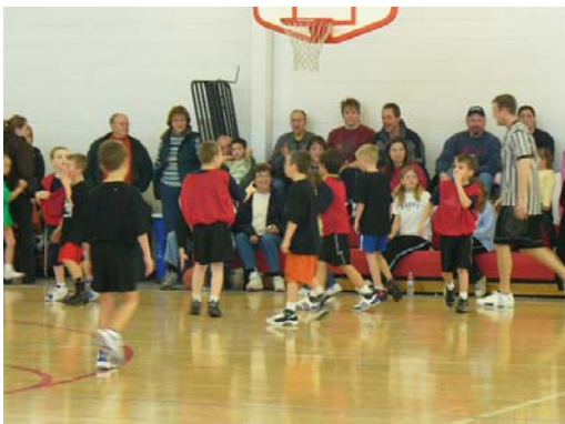
Children participating in the NBA Challenge in Huxley